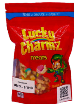
TOP 5 WHOLESALE 27

"In around 3% of people, THCO produces very powerful, almost psychedelic effects. For the rest of the 90%, it's ...very strong and potent..."