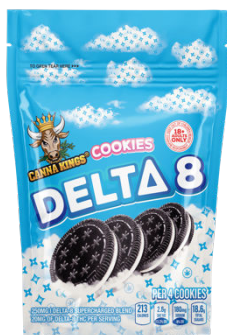
CANNA KINGS 25

"THC Hot Cheetos are infused with 600MG of Delta 8 THC in a single bag and can easily be finished in one sitting."