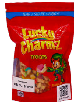
TOP 5 WHOLESALE 27

“Around 3% of people, THCO produces very powerful, almost psychedelic effects . For the rest of the 90%, it’s ...very strong and potent...”