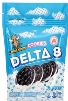
CANNA KINGS 25

“THC Hot Cheetos are infused with 600MG of Delta 8 THC in a single bag and can easily be finished in one sitting.”